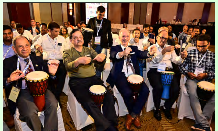
Grand cultural evening “Symphony of 50 years” at PM 24