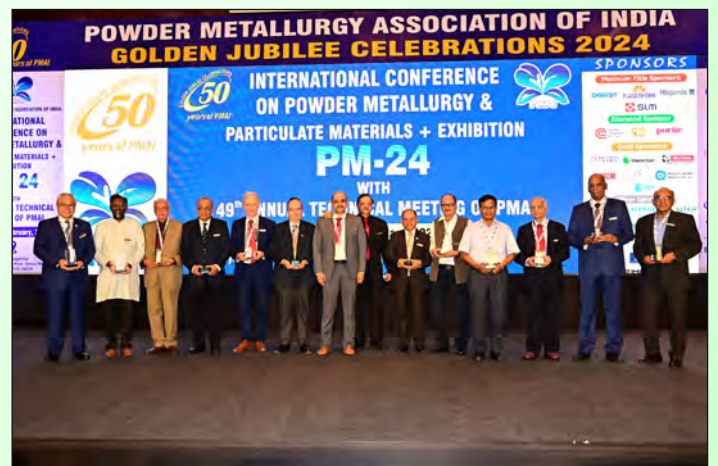
Past Fellows of PMAI at Golden Jubilee Celebrations