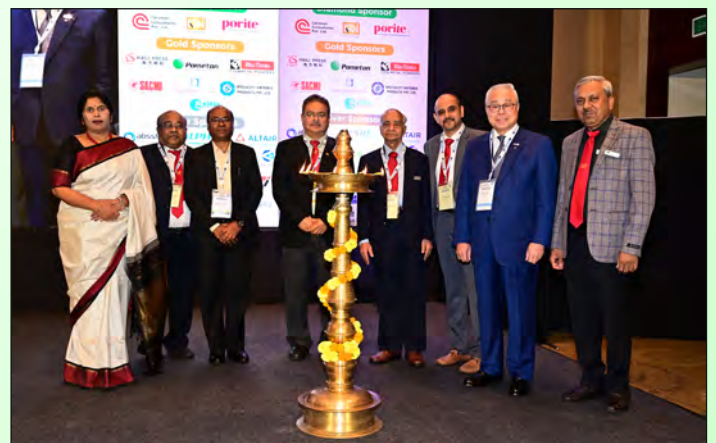
Lamp lighting Ceremony at inauguration of Golden Jubilee celebration of PMAI alongside International Conference PM24